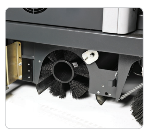
No-tools removable main broom and filter simplify maintenance