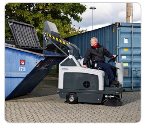
Hydraulic, high-dump hopper provides easy and safe disposal of large debris volume