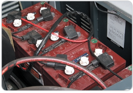
Large battery package provides high productivity and provides quiet, emission free operation