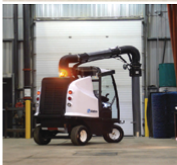
TOP LEFT 48" (1.2 m) Wide Vacuum Head