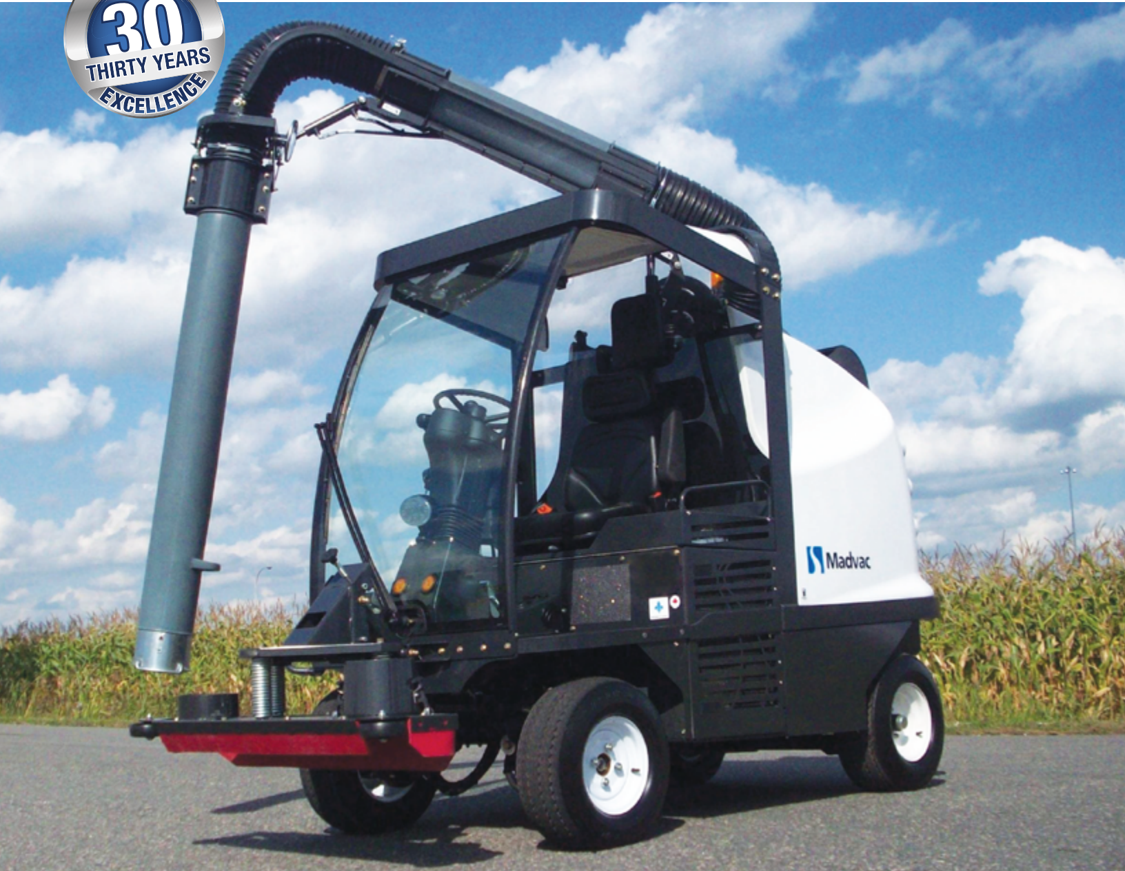
Madvac ® LR50 – Compact Robotic Arm Litter Vacuum