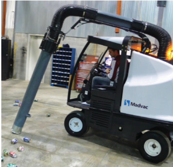
ABOVE Robotic arm controlled via a joystick