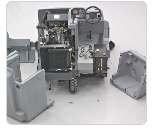
MaxAccess<sup>™</sup> allows faster repairs and less downtime so the sweeper spends less time in the shop and more time sweeping.