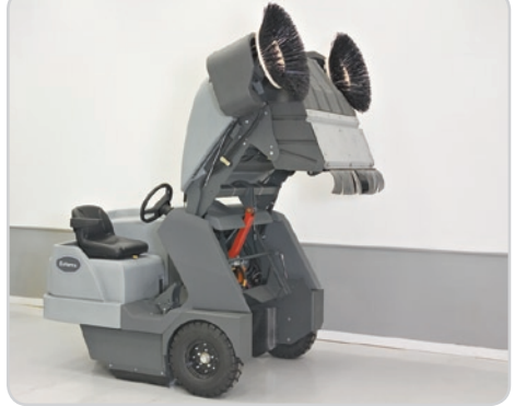
For optimal safety, the operator controls the hopper safety arm from the seat. The sweeping systems automatically shut down when the machine stops.