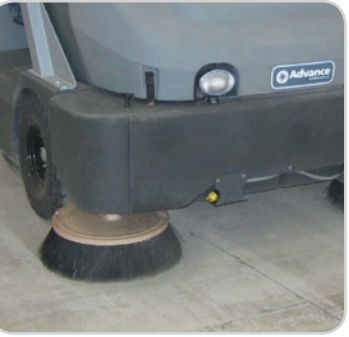
DustGuard<sup>™</sup> suppresses airborne fugitive dust allowing continuous use, and increasing productivity by up to 71%.