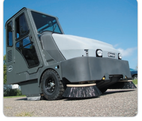
The optional all weather cab keeps the operator comfortable and productive. Clear-View<sup>™</sup> window in the cab provides a safe view of the right side broom.