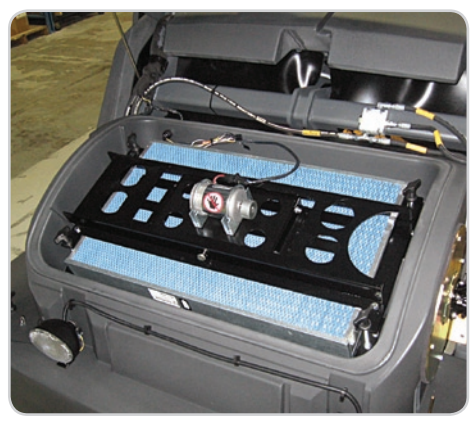
Ultra-Web ^{\odot} dust filter is >98% efficient on 0.3 - 1 micron dust. This meets MERV 13 on the ASHRAE 20 point scale.