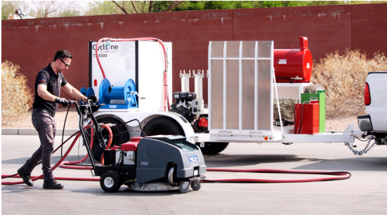
CY210 SHOWN WITH THE TR5500