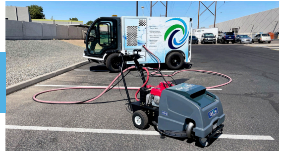
CY210 SHOWN WITH THE CY5500