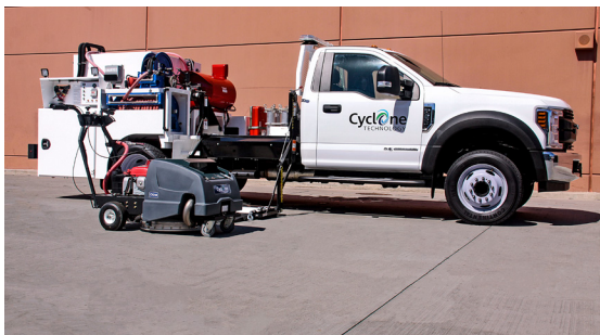
CY210 SHOWN WITH THE SK2