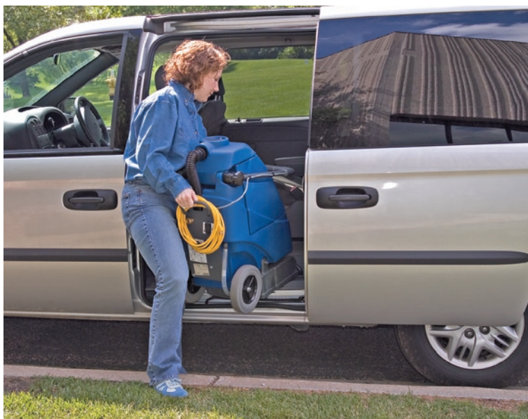
Hand grips and compact folding simplify easy lifting and transport.