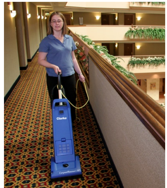
Light handle weight won't fatigue the operator.

Unlike most dual-motor vacuums, the CarpetMaster has its vacuum motor located at the base of the machine. The result is a lighter handle weight. That means less fatigue for the operator.