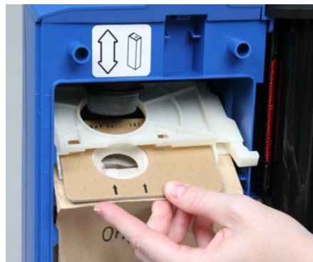
Quick and simple bag replacement. Just lower the bag holder and pull your used bag out, then slide in a new bag and snap holder back into place. Easy as 1-2-3!