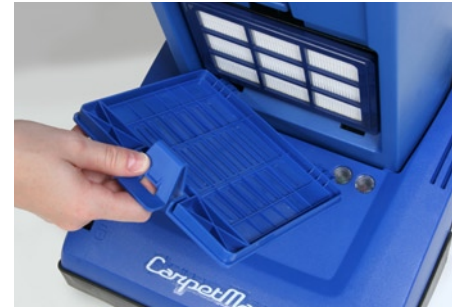
Convenient access to standard H.E.P.A. filter.