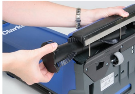
Easy to change brush. Simply unlock the brush and pull out.