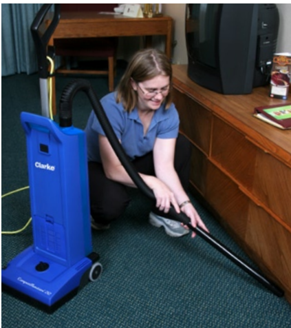
Easy to use quick-draw detailing wand and tools.