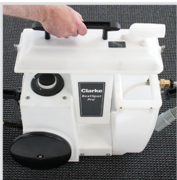
Recovery tank conveniently empties and can be rinsed.

The BextSpot Pro® provides a compact, lightweight highly portable tool for quick carpet or upholstery spot clean-up. With a 1 gallon tank, there is plenty of solution capacity for the emergency small jobs that present themselves in schools, offices, food service areas or healthcare facilities. With a powerful pump and vacuum motor, this very convenient machine gets the job done fast, and can then be stored away out of sight.