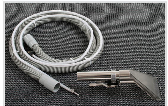
8 foot hose and clear hand tool.