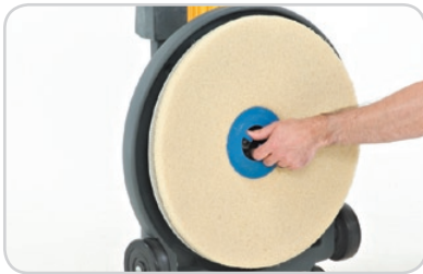
EZ Store™ construction makes for easy pad changing.