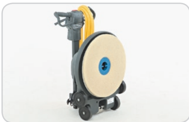
EZ Store™ construction allows the Advance Advolution™ 20 and 20XP to be stored in the smallest of cleaning closets.