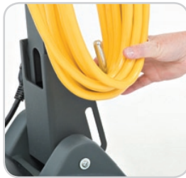
Rotating cord hook lets 75 feet of cord be removed at one time.