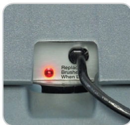
Carbon brush indicator lights red when brushes need to be replaced.

Red SafeStart™ button only allows activation when handle is tilted back for use