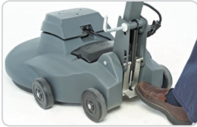
Simple, one step handle release.