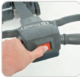
Red SafeStart™ button only operates in operator position.