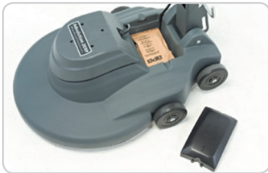
Rotomolded body provides lasting durability. Dust bags are easy to access.