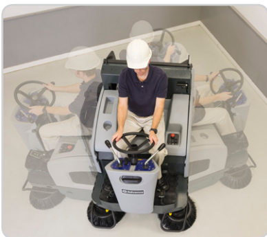
Front-wheel powered and steered drive wheel provides superior maneuverability, allowing operators to sweep in tight corners or narrow aisles.