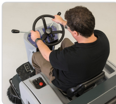
Clear-View™ enhances operator safety.