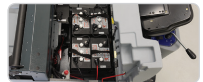
Tools-free broom and filter removal, and easy access to battery compartment makes routine maintenance and service fast and easy.