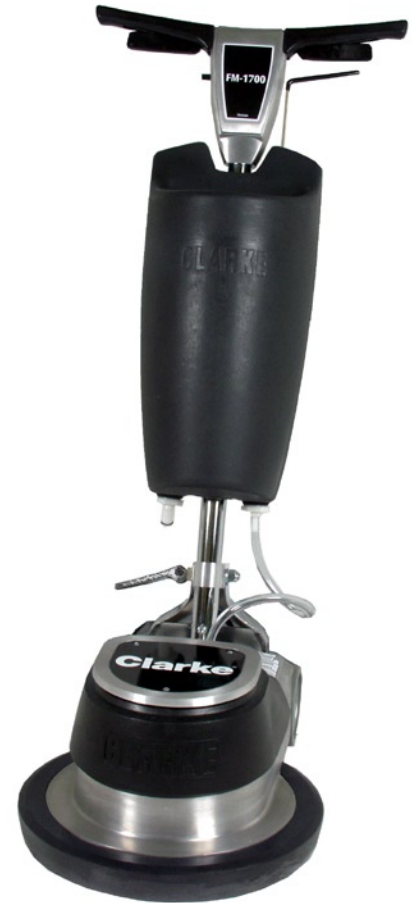
Shown with the optional 4 gallon solution tank

Quality and durability have allowed the FM Polisher to be called the "best in the industry." The motor and gearbox are hand-built and backed by an exclusive 7 year warranty.