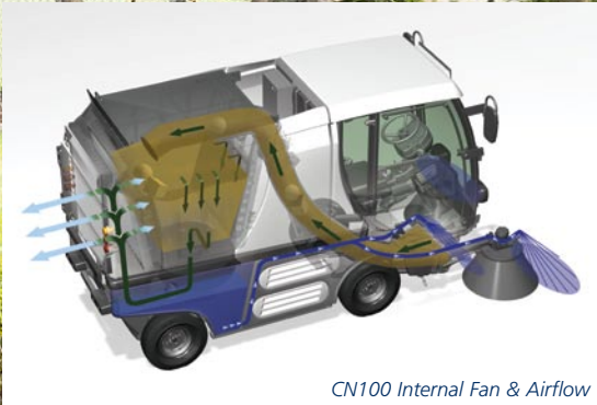
CN100 Internal Fan & Airflow