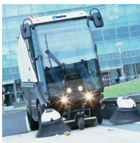
ABOVE LEFT Front wheel drive makes curb climbing effortless