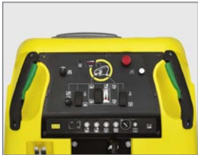
Intuitive control panel!