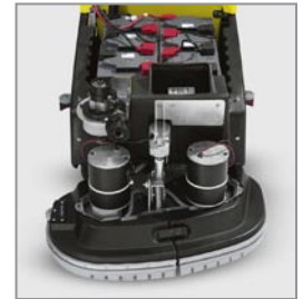
Easy access to brushes and batteries - no tools needed!