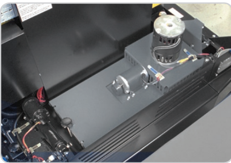
Dust control option provides dust-free sweeping before debris enters the scrubbing area.