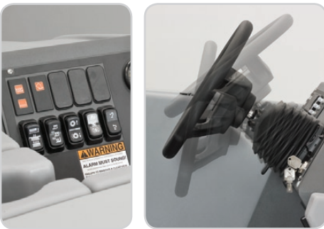
Reliable rocker switches and a tilt steering wheel result in easy-to-use controls and low maintenance costs.