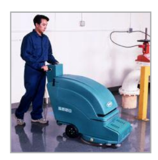
Ideal for retail, education and healthcare, the 2510 and 2550 models are excellent for burnishing hard floor surfaces to a brilliant shine.

Get high gloss performance and productivity with these 20 in/50.8 cm battery-powered burnishers! Choose either the pad assisted model 2510 or 2550 self-propelled unit. The patented floating pad head design provides 15-40 lbs/7-18 kg of variable down pressure for superior performance and glides over irregular floors to ensure even burnishing. These burnishers employ a built-in dust control system that captures fine particles in a filter bag for better indoor air quality. Airflow created by the pad motion forces dust and particulates through the clean air system. Compact design and a low profile base allow these battery machines to burnish under shelving and fixtures. Cover up to 21,000 ft²/1,951 m² per hour with greater mobility and productivity.