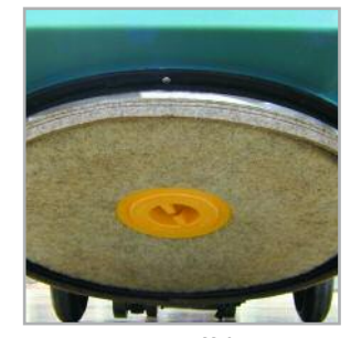
Tilt back shut-off for operator safety and quick pad adjustment and removal.