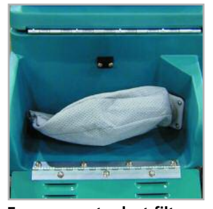
Easy access to dust filtration compartment for quick disposal of debris.