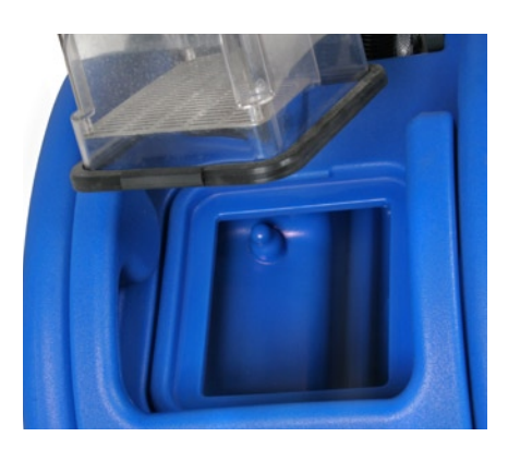
Large recovery access makes cleaning the tank a breeze.