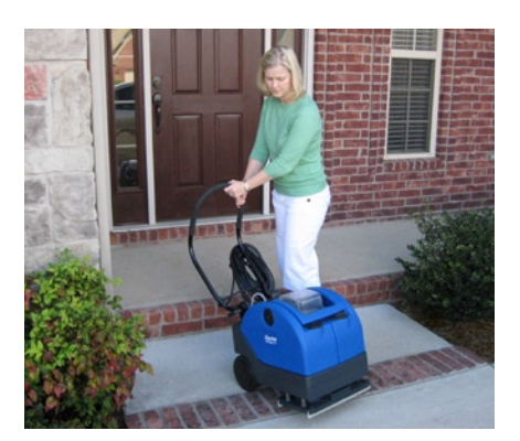
Easy to transport design and light weight make the Vantage 13 great for home cleaning applications.