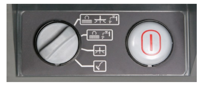
Universal symbols on the control panel simplify operation.