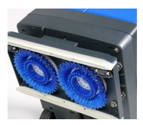
The disc brushes are surrounded by two sets of double squeegees for quick solution pickup, keeping floors dry.