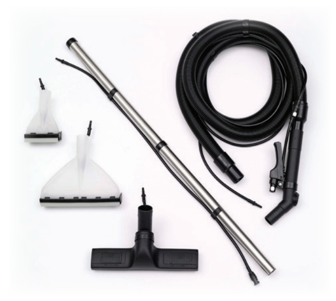
An optional combination tool for hard floor and soft floor use is available, making the Vantage 13 a dual purpose machine.