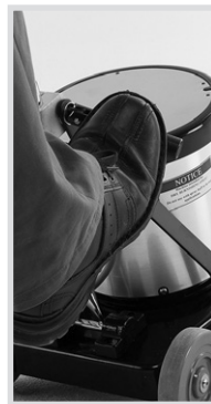
Foot-activated handle lock.