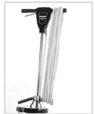
50 ft safety yellow cord.