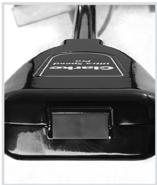
Safety lock-out switch.

The Ultra Speed Pro ® 1500 features a powerful DC rectified motor that drives a consistent 1,500 rpm's to maintain a wet-look shine on finished floors. With easy-to-use fingertip controls and multiple safety features, such as handle-mounted safety switch and circuit breaker, and a 50 foot yellow cord, this machine gets the job done fast. The handle can be operated on the locked position or allowed to float. A flexible pad driver is included.