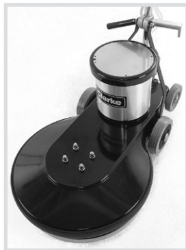
Cast aluminum chassis.