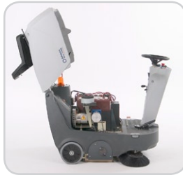
Clamshell design allows fast and easy access to all machine components for serviceability and preventative maintenance.

Simple and intuitive operator controls for quick training and consistent results