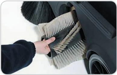
No tools needed to adjust main broom height and to quickly remove and replace the main broom.