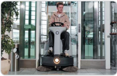
Compact size makes the Terra® 3700B easily transportable in elevators.