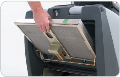
Dual filtration system is accessible without tools and includes electric filter shaker for extended productivity between cleanings.