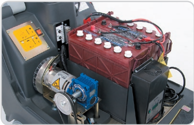
Large standard 24 Volt, 195 Ah battery package and onboard charger result in maximum run-time and convenience.