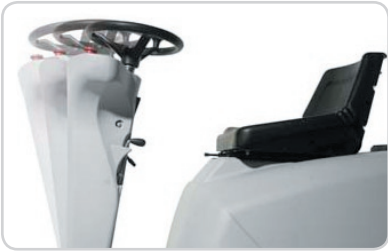
Adjustable steering column and seat provide comfort and easy accessibility to enter and exit the operator's position.