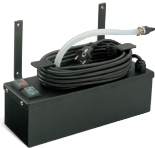
HT 1800 Heater