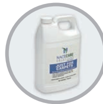
Just For Carpets