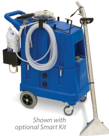
Shown with optional Smart Kit

At only 49 lbs., the TP 8X is light and easy to transport, yet has all the power of a full-size extractor. With its 130 psi pump and 20-foot vacuum and solution hoses, the TP 8X is ready to tackle even the largest of jobs.