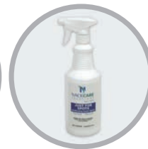
Just For Spots