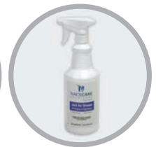
Just For Grease