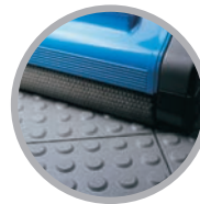
Profiled Rubber and Ceramic