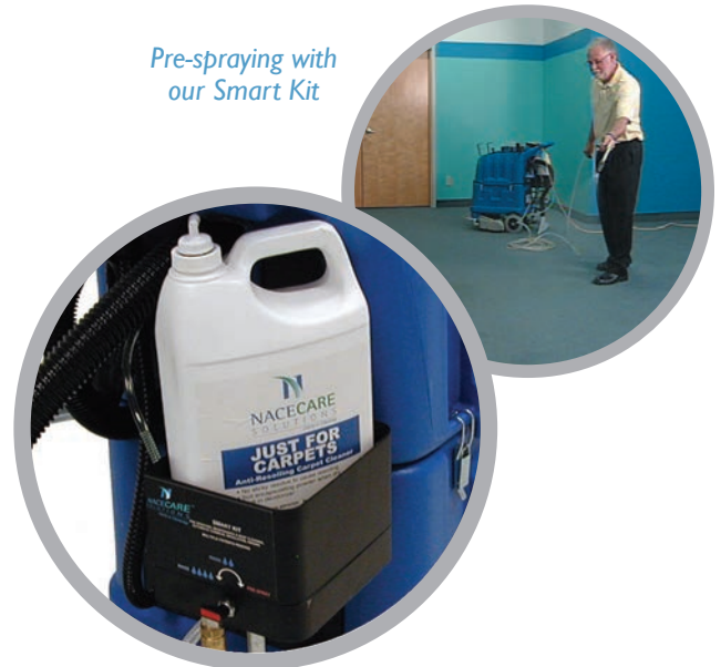
Pre-spraying with our Smart Kit

Just for Spots is a water-based general spotter formulated to remove 90 percent of most spots in carpets. This ready-to-use, 32 oz. bottle is safe to use for general spot cleaning without harming carpet fibers or causing re-soiling. Simply apply onto a spot and blot with a white terry cloth towel or remove with a spotting machine or extractor.