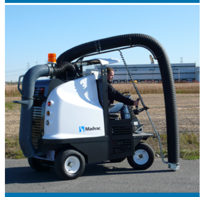
ABOVE Hydraulic arm controlled via a joystick

The Madvac<sup>®</sup> LN50 litter collector is used worldwide because: It works. It lasts. It pays for itself. Fast!