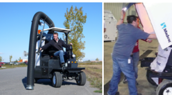
LEFT Madvac® LN50