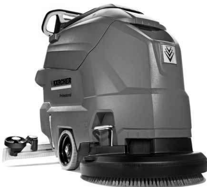
BD 50/50 C CLASSIC BP