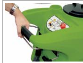
BRUSH CONTROL WITH AUTOMATIC DELAYED STOP