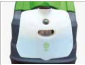
SEPARATE DETERGENT DOSING SYSTEM (OPTIONAL)