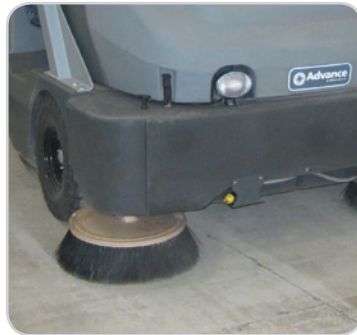
DustGuard™ suppresses airborne fugitive dust allowing continuous use, and increasing productivity by up to 71%.