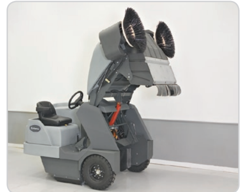
For optimal safety, the operator controls the hopper safety arm from the seat. The sweeping systems automatically shut down when the machine stops.