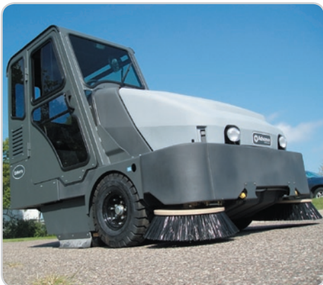
The optional all weather cab keeps the operator comfortable and productive. Clear-View™ window in the cab provides a safe view of the right side broom.