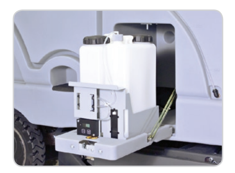
The AXP™ Onboard Detergent Dispensing System provides productivity and savings through accurate dispensing.