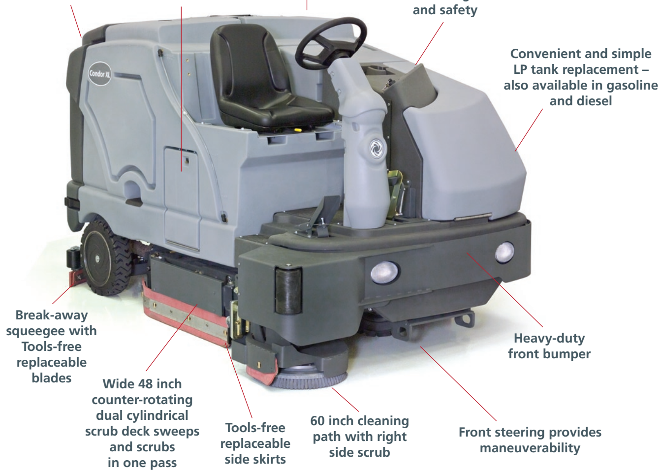
Ergonomic cockpit and simple controls with Clear-View™ sight lines