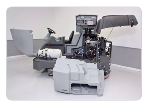
MaxAccess™ design provides 360 degree access to machine components.

AXP™ Onboard Detergent Dispensing System - Delivers chemical accurately at the specified dilution ratio, allows a user to switch chemicals effortlessly and without waste, and allows the machine to be filled anywhere there is fresh water.