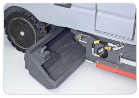
Corrosion resistant hopper slides out easily for maintenance.