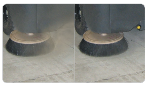
DustGuard™ suppresses airborne fugitive dust allowing continuous use, and increasing productivity by up to 71%.