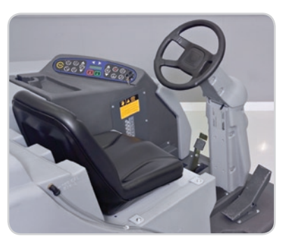
The Clear-View<sup>™</sup> machine design provides excellent sight lines to the floor from the comfort and safety of the operator's seat.