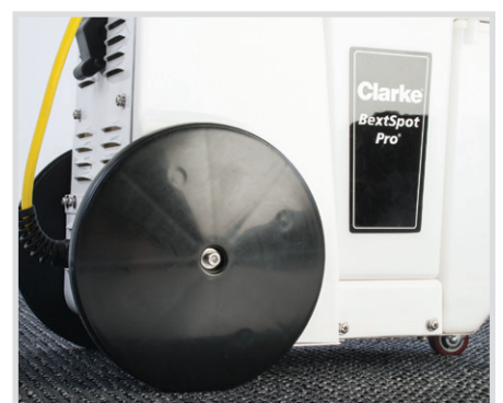
Built-in transport wheels.