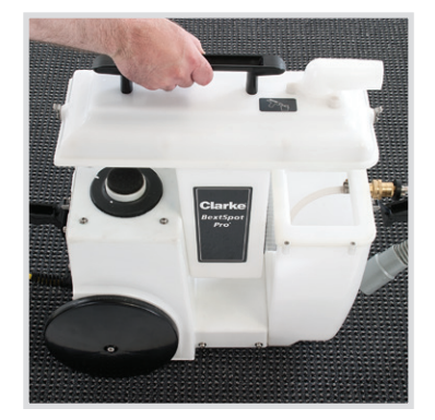
Recovery tank conveniently empties and can be rinsed.