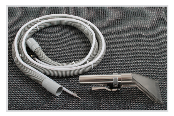
8 foot hose and clear hand tool.