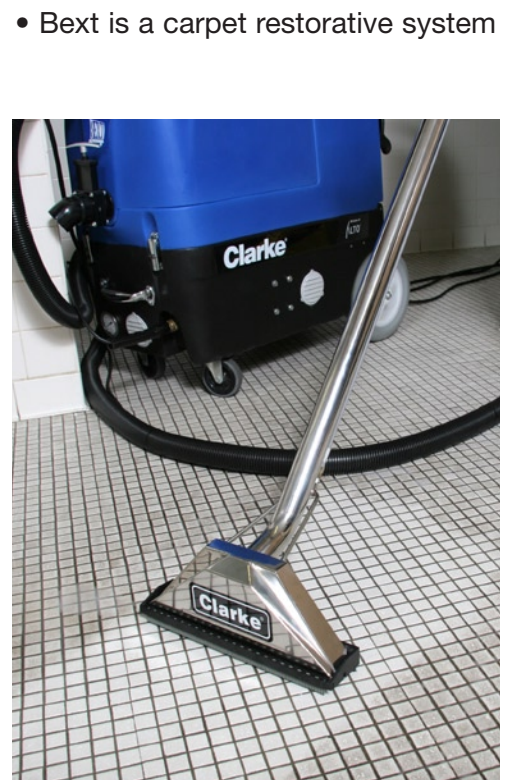
Turn your Bext extractor into a dual function (carpet and tile) machine with CHAT.