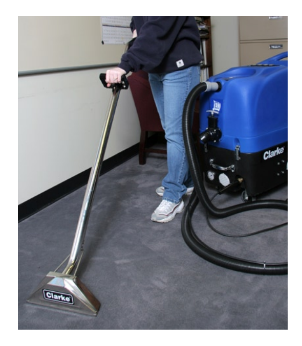
Bext® extractors are designed to be easy to use, productive, quiet, and portable.