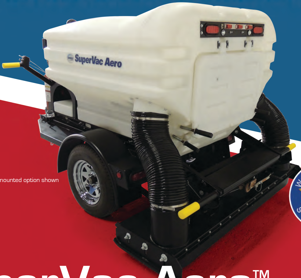
*Trailer mounted option shown

The People You Know. The Products You Trust.