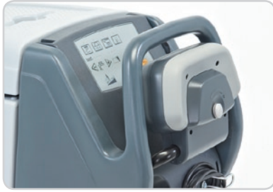
Ergonomic and safe paddle system for operator comfort