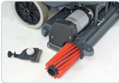
Tools-free removable brushes on all model scrub decks