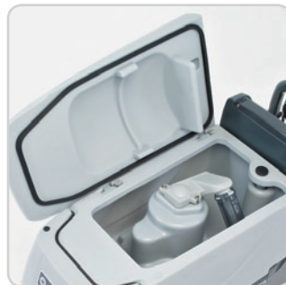
Large recovery tank with easy access to inspect and clean tank. Easy access to ball float shut off.