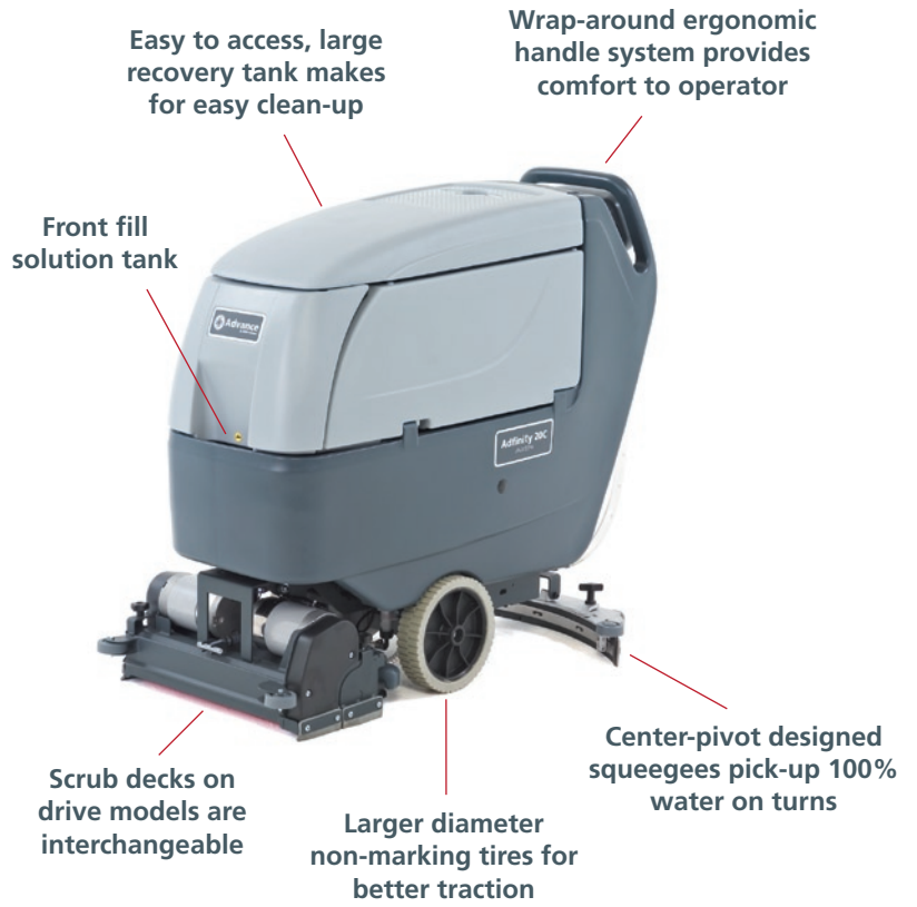
Easy to access, large recovery tank makes for easy clean-up