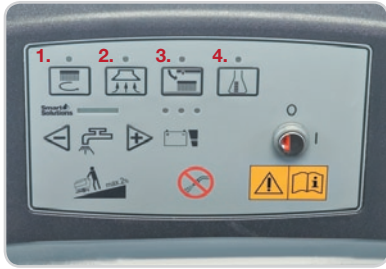
Easy to use control panel 1. Scrub 2. Vacuum 3. Pad drive click-off 4. AXP on/off; set dilution rate at control panel