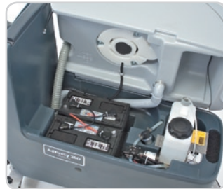
Access to batteries and AXP™ Onboard Detergent Dispensing System