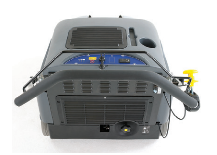
Both brooms are adjustable from the operator's position.