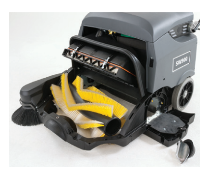
Time-saving maintenance: Broom replacement, and other routine maintenance, can be performed without tools.