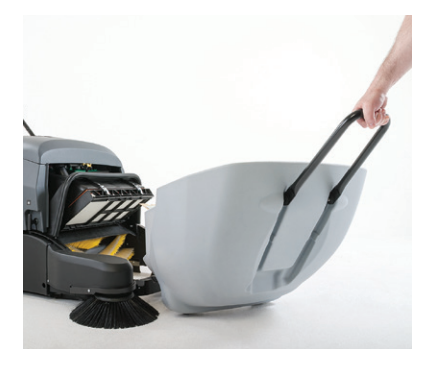
Single hand hopper removal and installation with wheels to facilitate easy transport for dumping.

Entertainment Facilities Hotels and Hospitality Facilities