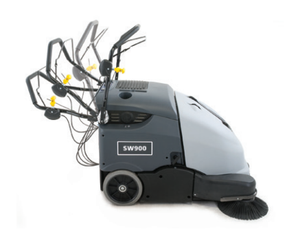
Handlebar adjusts to fit a wide range of users and folds to provide convenient transport and storage.