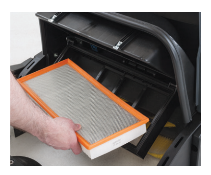
Single-stage high capacity dust control system for more effective dust control. Access filter without tools.