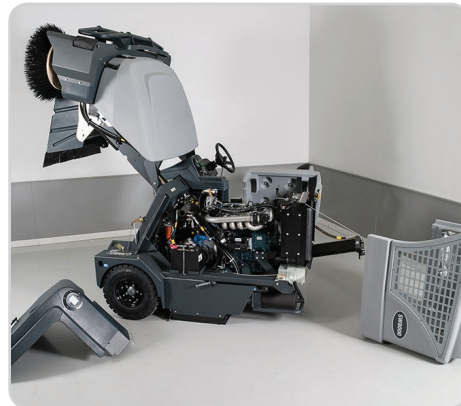
MaxAccess™ allows faster repairs and less downtime so the sweeper spends less time in the shop and more time sweeping.