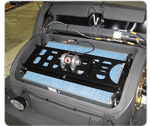
Ultra-Web® dust filter is >98% efficient on 0.3 - 1 micron dust. All dust is locked in the hopper behind only 1 critical seal incorporated in the dust filter. Captured dust is shaken directly back into the hopper.