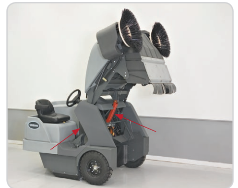
For optimal safety, the hopper safety arm can be engaged without leaving the operator seat. In addition, the sweeping systems automatically stops when the machine motion stops.