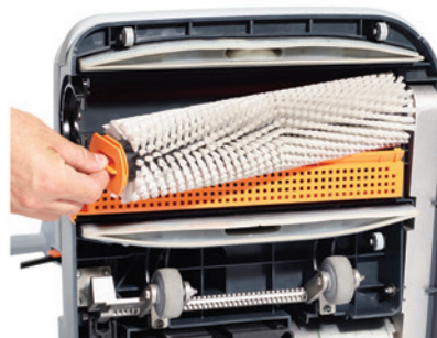
Easy to maintain with tools-free brush and squeegee removal.