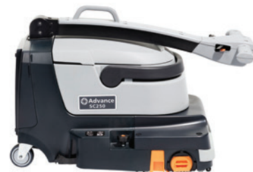
Adjustable, ergonomic handle with built-in touch sensors that simply and safely engage scrubbing action. Handle also folds over for easy transport and storage.