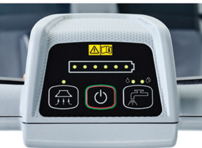
Two solution flow settings and a low solution indicator light and battery level indicator ensure effective cleaning.

Schools Retailers Hotels Restaurants Healthcare Facilities