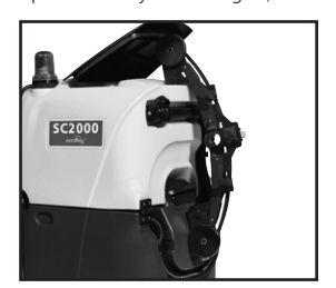
Built-in squeegee hanging system on tank allows for safe transportation through doorways and tight areas, while permitting tank drying.