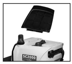
Easy to clean with recovery tank lid completely removable. (Shown with optional safety beacon light.)