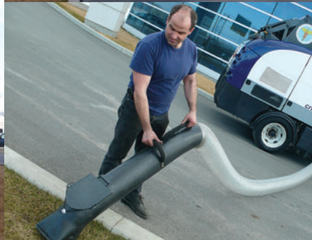
LEFT Joystick controlled robotic vacuum hose arm collects debris in hard to reach areas and safely vacuums up trash cans.