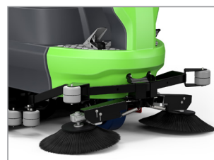
PRE-SWEEP SYSTEM *CYLINDRICAL VERSION ONLY*