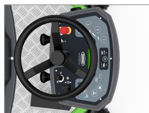
PRESET WORKING PROGRAM