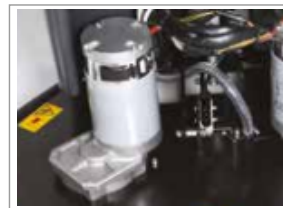
HIGH QUALITY MOTOR GEAR BOX