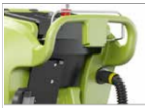
NEW ERGONOMIC HANDLE