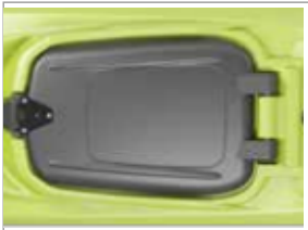
NEW LARGE COVER