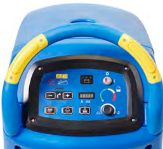
Control panel with intuitive display for ease of operation

Warranty: Isolators covered under warranty