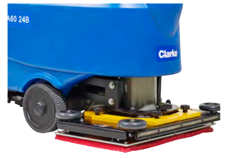
☒ * Orbital technology cleans with multi directional scrubbing action while using less water and fewer chemicals