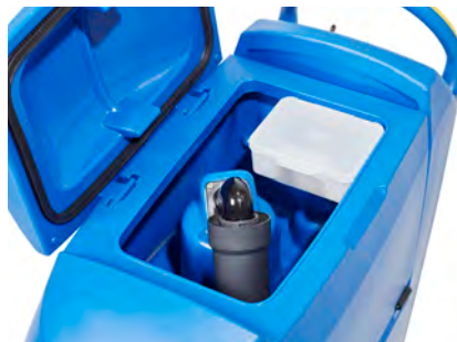
Fully accessible recovery tank with debris catch cage allows for simple cleanup