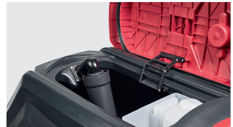
Large opening recovery tank and standard debris tray for quick and thorough clean up