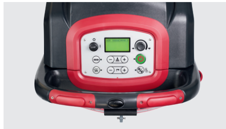
Intuitive control panel with LCD screen comes standard on all models (AS6690T/AS7690T shown)