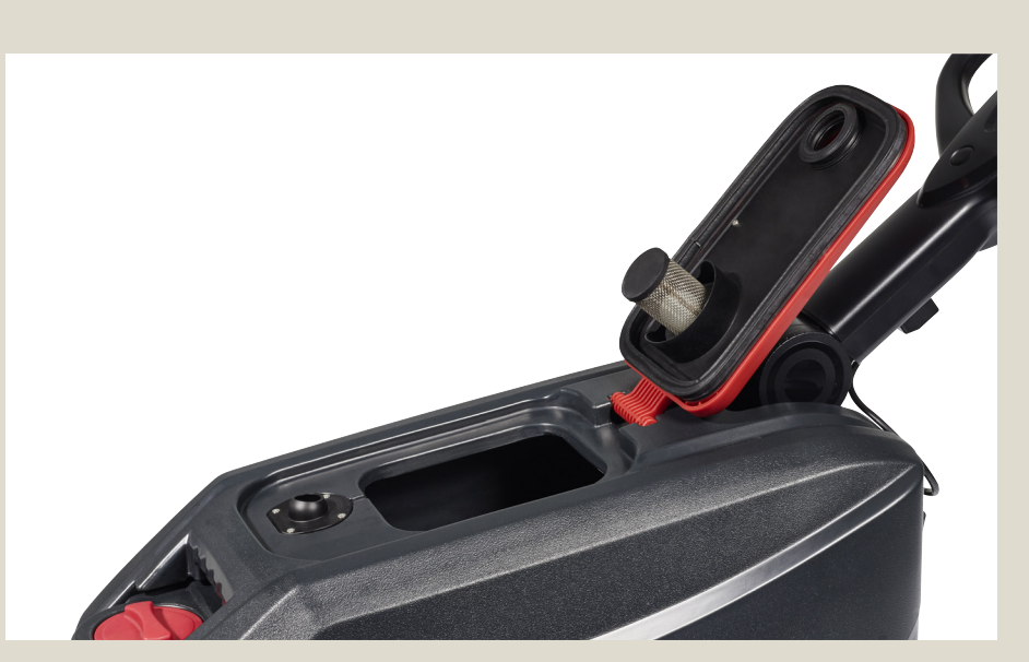
after it's been cleaned to avoid bad odor.