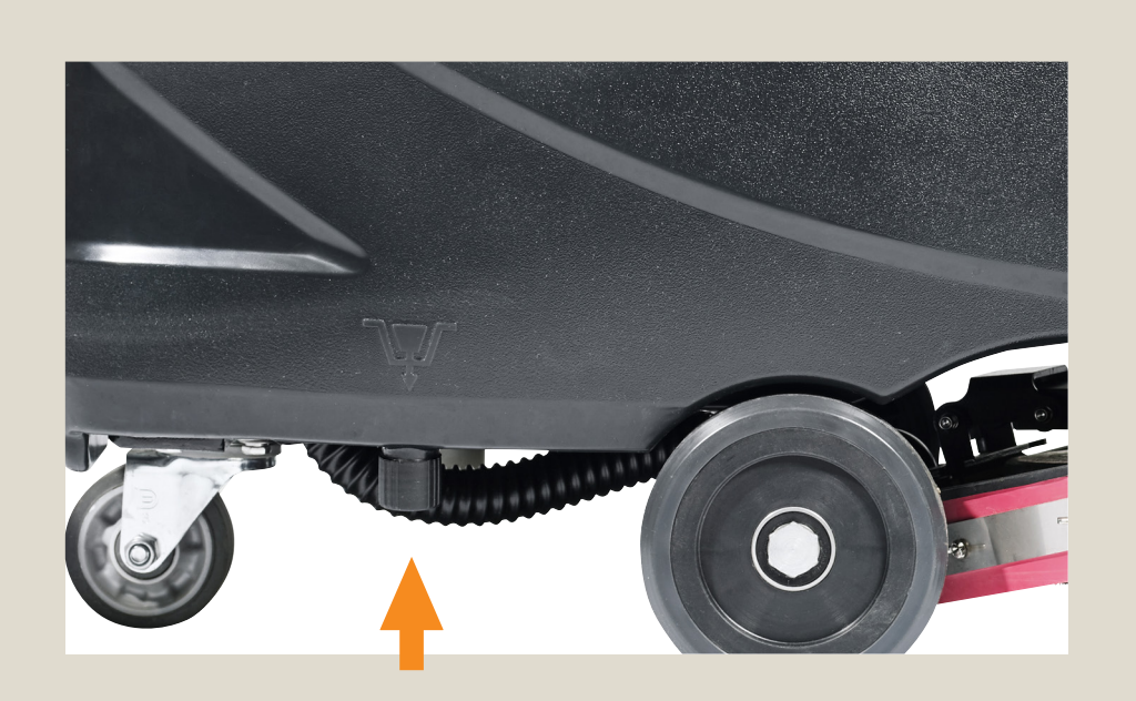
Daily: Empty the clean water tank using the solution tank drain knob under the machine.