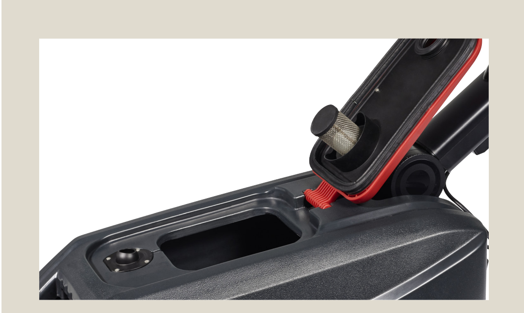
Daily: Inspect and rinse the float ball cage and inspect and clean the lid gasket if required.