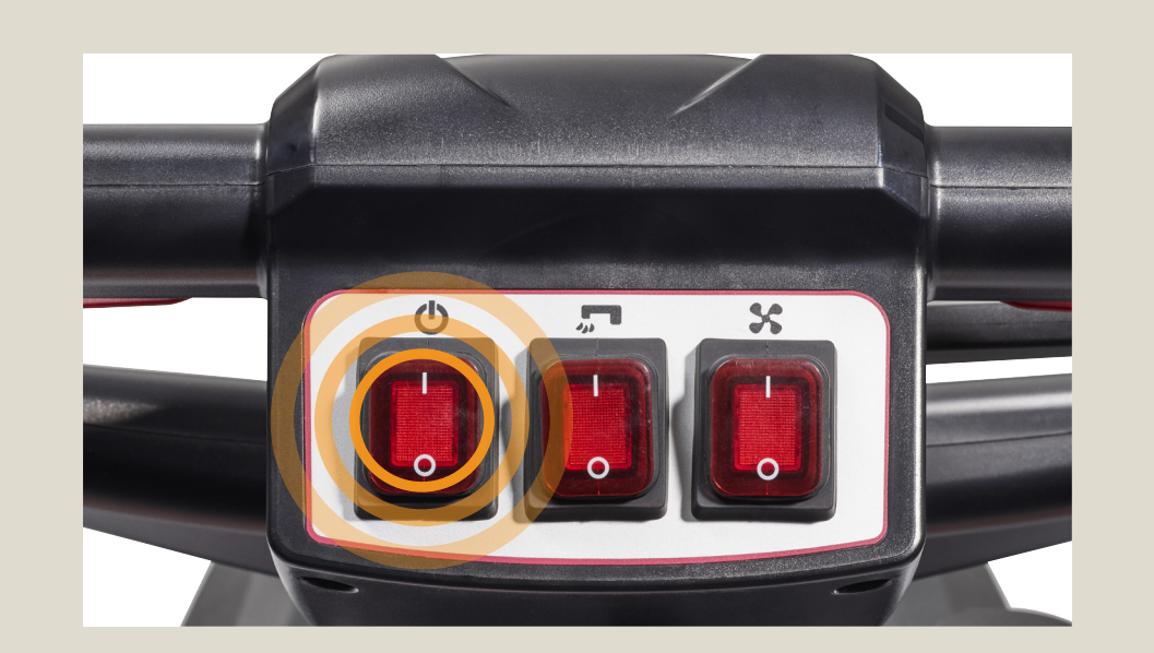
When scrubbing is complete, turn off the on/off button to perform the following maintenance.