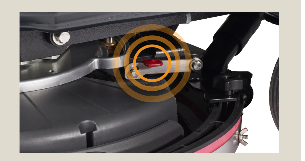
Lift the squeegee up by hand until it locks in up position and turn suction off for double scrubbing.

To go back to working mode, use the red lever to release the squeegee and turn suction on again.