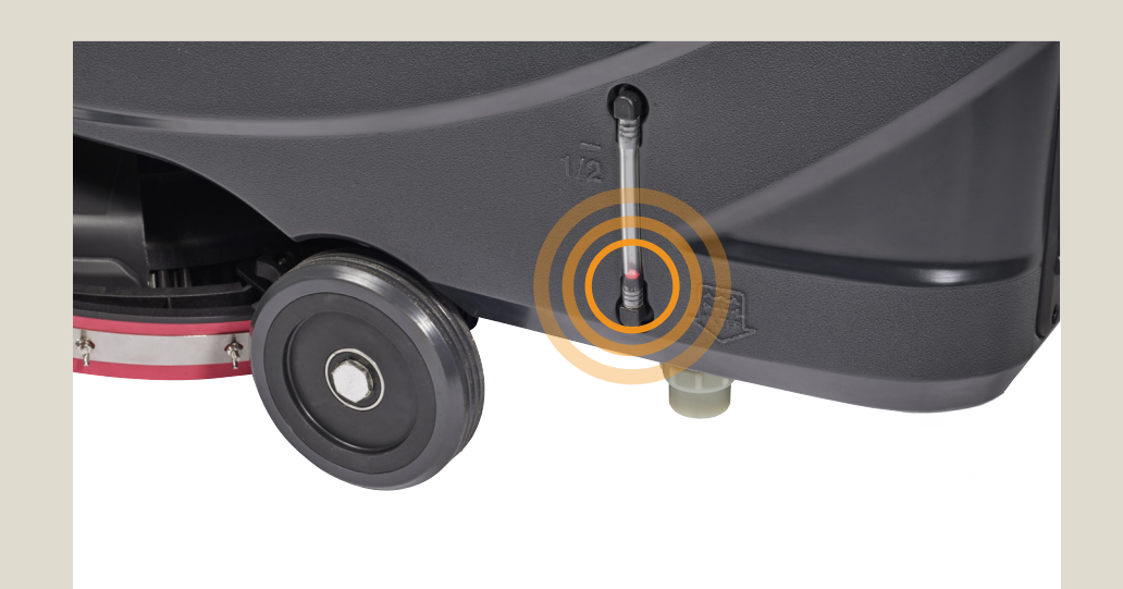
Check the level of water with the red ball on the left side of the machine.