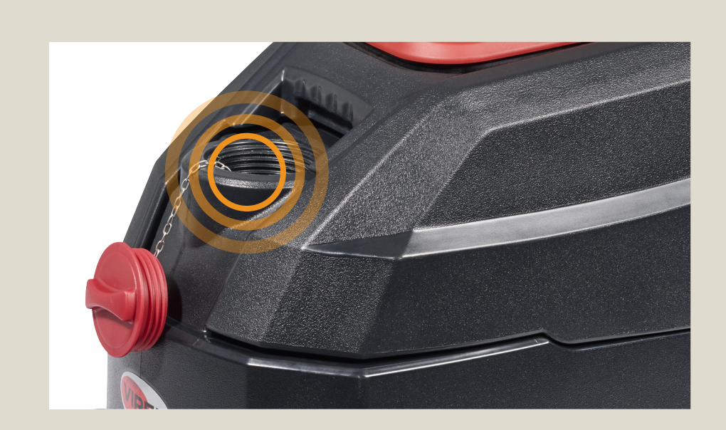
Remove the red cover, fill the tank with clean water and use maximum temperature 40 degree. Add appropriate low foaming detergent according to dosage information.