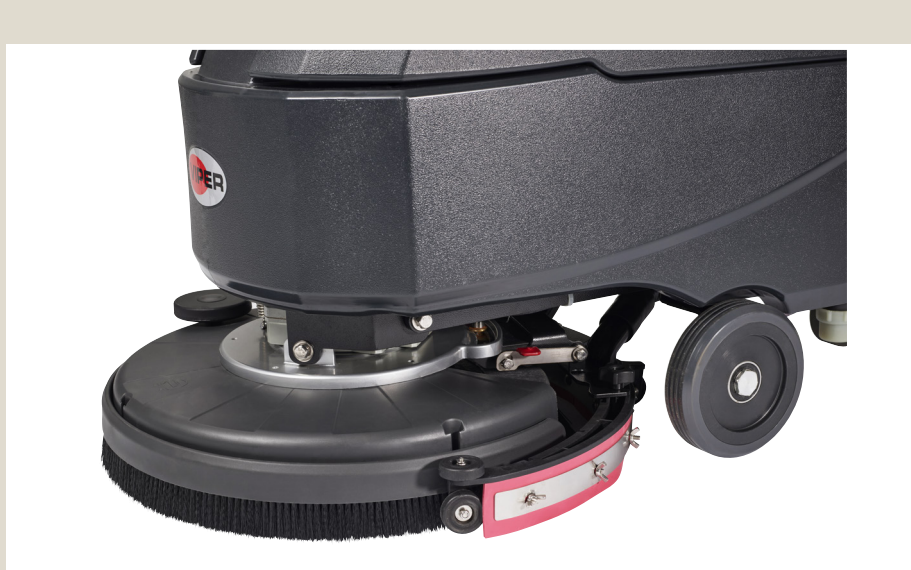
Place the brush or the pad-holder under the deck and Lower the deck or the brush/ pad holder by pressing the pedal. The squeegee is raised and lowered with the deck.