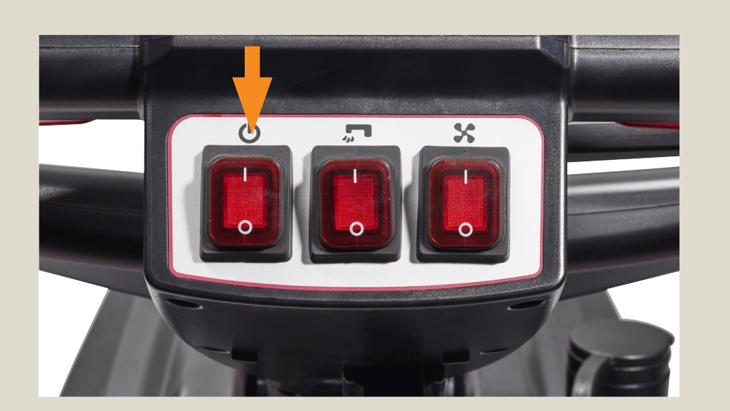
Connect the power supply plug to the electrical mains and press machine ON button.