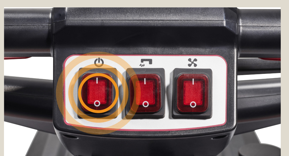
When scrubbing is complete, turn off the machine to perform the following maintenance.