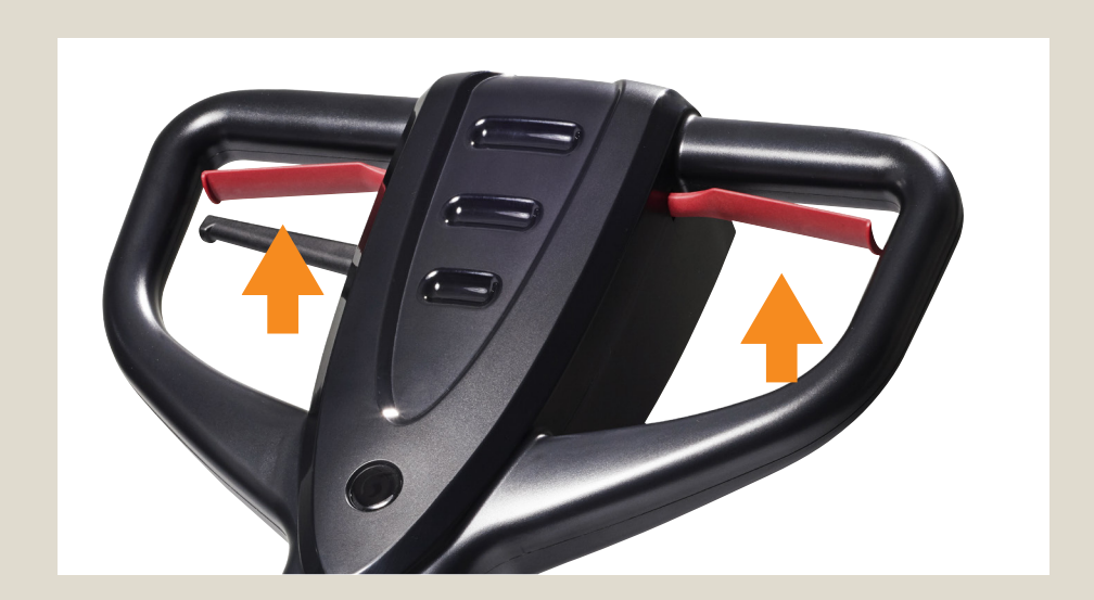
Press one of the safety-switch levers on the handle to engage the brush/pad-holder, then release it.