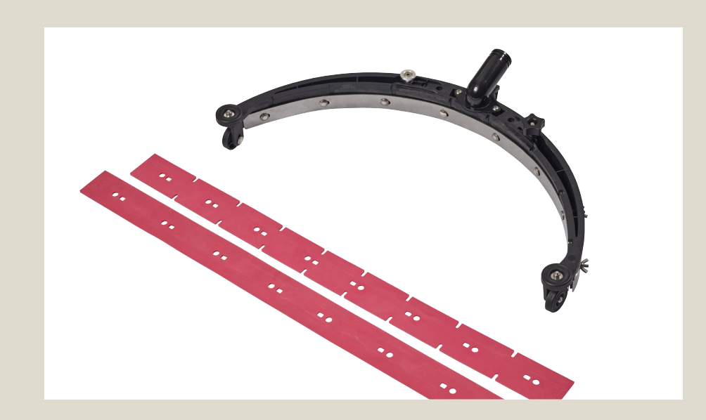
Daily: Remove the squeegee, and clean. Inspect the blades and flip them or replace them if required.

To remove the brush/padholder lift the deck by pressing the pedal and manually release the brush/pad