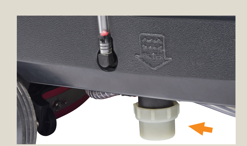
Weekly: Inspect the solution filter and clean if required.

To remove the brush/padholder lift the deck by pressing the pedal and manually release the brush/pad