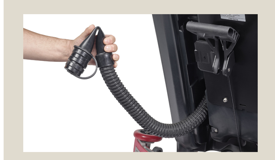
Daily: Empty the recovery tank using the recovery empty hose. Bend the soft part before removing the cap to control the flow.