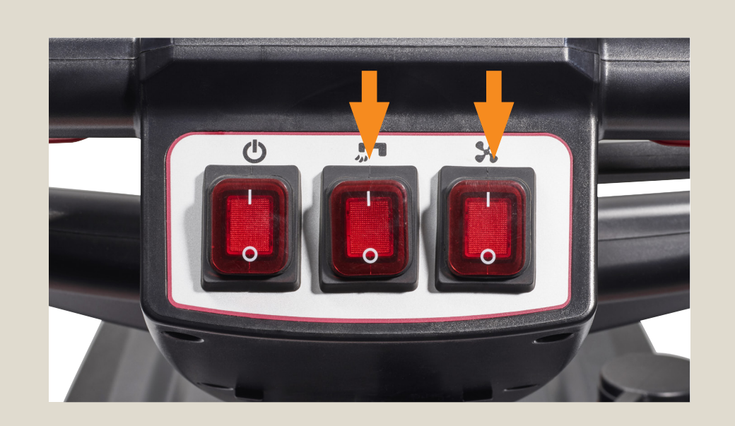
Press solution and vacuum buttons on and start cleaning by placing the hands on the safety switches.