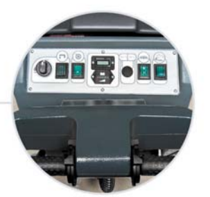
Easy to use controls and gauges

Betco's Foreman AS20B Automatic Scrubber offers a compact design with improved sight lines that enhance safety during operation. Simple controls are easy to use and reduce operator training. Additional features include non-marking wheels, float shut off with anti-foam funnel, and easy rear access to major components and electrical system.