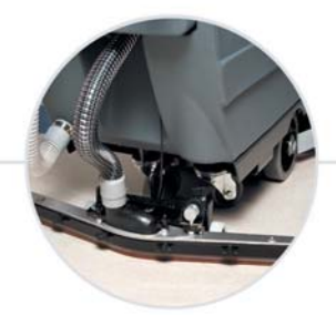
Weighted squeegee provides effective water recovery