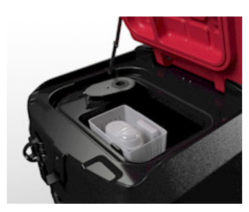
Easy-access debris tray