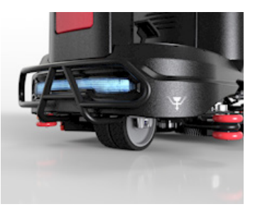
Sturdy bumper with high-visibility lights