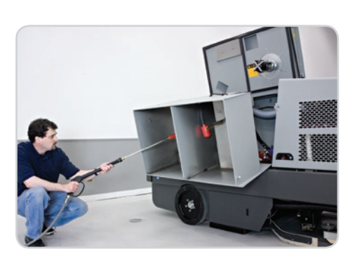
Recovery tank tilts out for quick and easy clean-up, reducing the amount of time needed for draining and refilling.