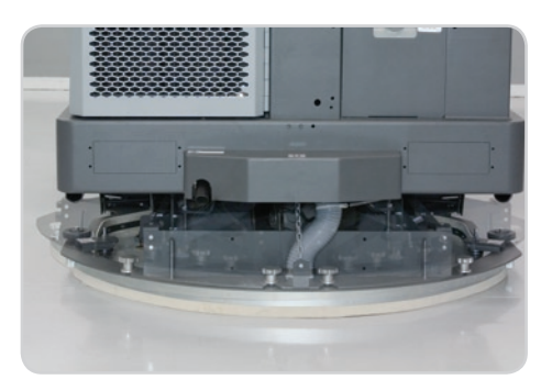
Patented Accu-Track™ squeegee provides superior water pick-up even during the tightest turns.