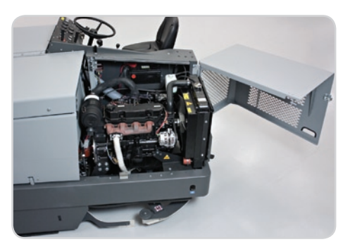
Maintenance is a breeze with easy-to-reach engine, electrical and hydraulic components.