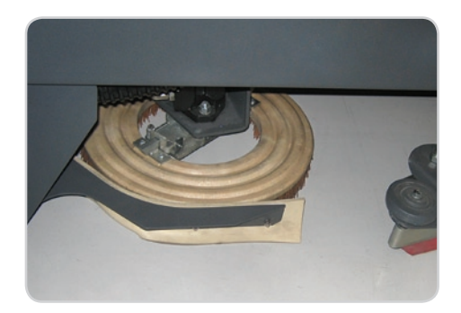
Scrub brushes with 600 pounds of downward pressure provide the most aggressive cleaning possible, yet brushes can be easily changed without tools.