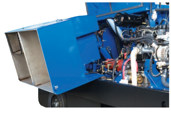
Recovery tank tilts out for quick and easy clean-up, reducing the amount of time needed for draining and refilling.