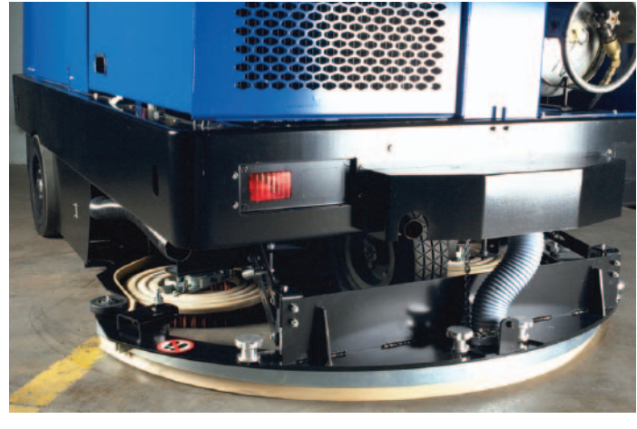
Patented Accu-Track™ squeegee provides superior water pick-up even during the tightest turns.