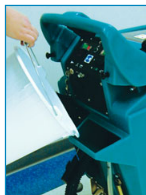
The 5100 is equipped with a convenient rear fill port that allows the operator to fill with a bucket or hose.

Tennant's automatic floor scrubber line offers a full range of walk-behind models, with variable scrub path widths, optional recycling systems and off-aisle cleaning, we're sure to have the right scrubber for your job. All of our scrubbers feature simple controls and easy-to-read gauges so that operators do a perfect job the first time. Built to last, our scrubbers are constructed of durable rotationally molded polyethylene to withstand daily wear and tear. Most importantly, Tennant scrubbers leave your hard floors clean and attractive, dry and safe.