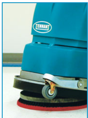
The Speedlock™ feature on the 5100 makes changing brushes or pad drivers as easy as touching a button.