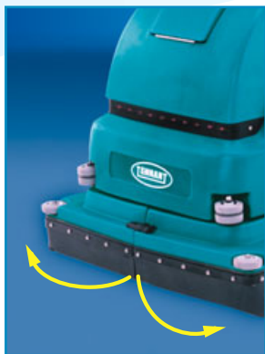
The swing out split skirt system on Models 5500-5560 allow for quick and easy brush/pad changes.