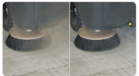
DustGuard™ suppresses airborne fugitive dust allowing continuous use, and increasing productivity by up to 71%.