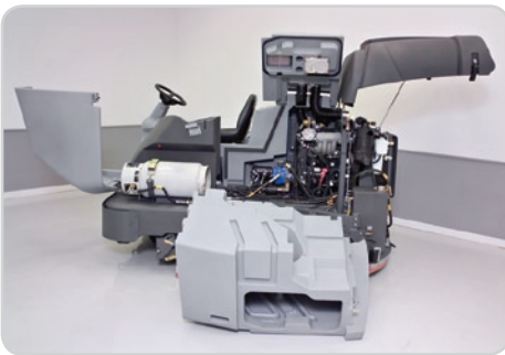
MaxAccess™ design provides 360 degree access to machine components.