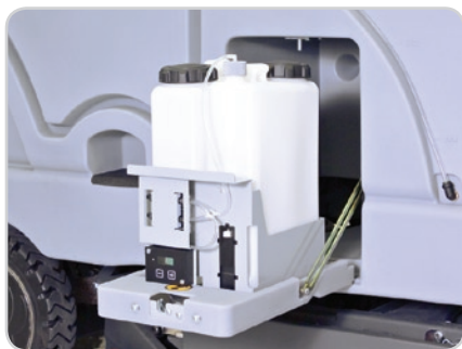
The AXP™ Onboard Detergent Dispensing System provides productivity and savings through accurate dispensing.