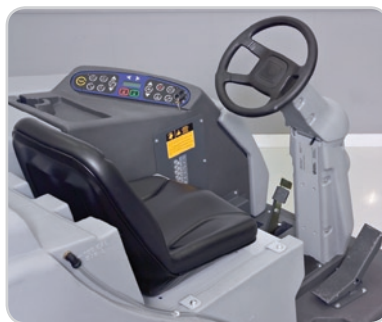
The Clear-View™ machine design provides excellent sight lines to the floor from the comfort and safety of the operator's seat.