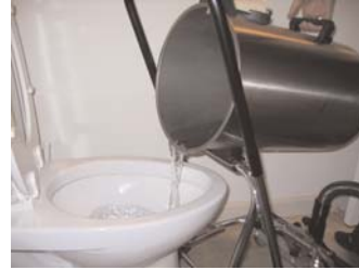
Easy draining with tipping dolly