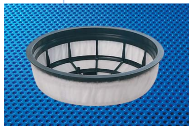
Large pan filter

This high-performance wet/dry vacuum is ideal for medium size areas. Low balance point and 5 casters provide stability and maneuverability.