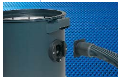
S 10 and S 20: Slide-in vacuum hose cuff

This vacuum cleaner provides the same powerful performance and handling features as the S 10. The larger capacity makes the S 20 ideal for commercial applications.