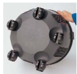
5 casters for stability and maneuverability