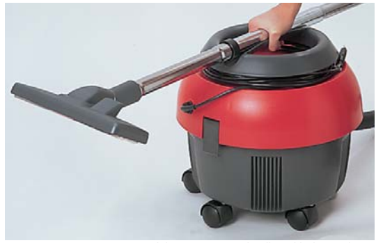
Round design, ergonomic handle and built-in cord wrap