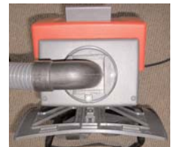
Hose attachment - left or right hand use