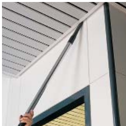
Cleaning in corners and hard to reach areas