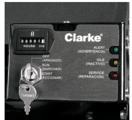
Control panel lights inform operator of emissions controls and engine performance. Planned maintenance intervals are easily monitored with the onboard hour meter, and the standard key-ignition switch prevents unauthorized use.