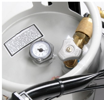
Large 20 pound 80% safety fill propane tanks offer long working time between refills and also prevents overfilling.