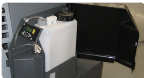
Captor® AXP™ allows control of detergent usage and the ability to use your choice of detergent