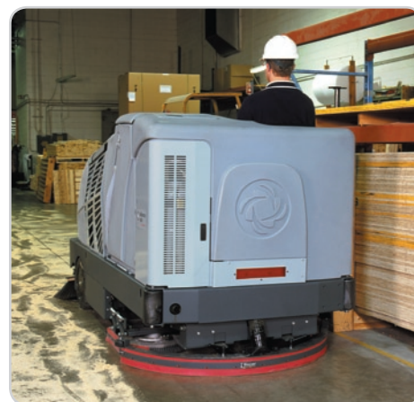
Aggressive scrub system removes ground-in dirt, while the squeegee leaves floors dry. Combined, you get complete cleaning in a single pass