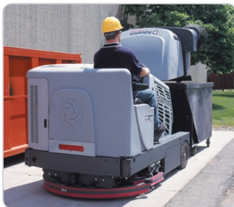
The ergonomic Clear-View™ design provides the operator with an unobstructed view of critical sweep zones