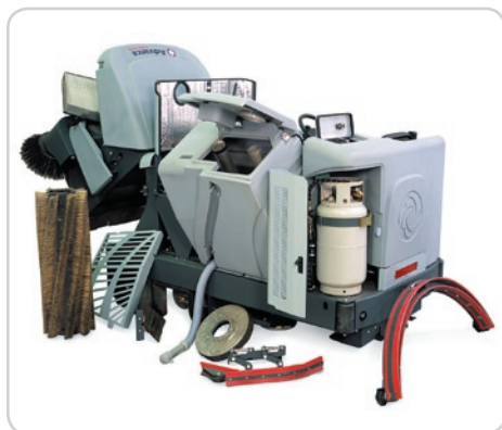
All major systems of the Captor® are readily accessible for easy inspection, cleaning and maintenance. Common maintenance and inspection operations can be completed without tools