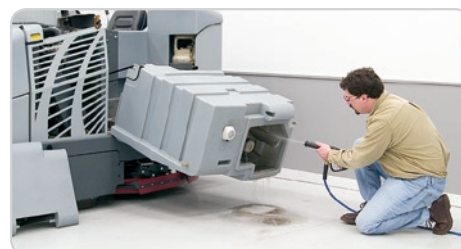
The tip-out recovery tank makes equipment clean-up safe and simple and helps keep your recovery tank fresh