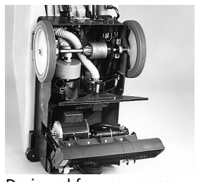
Designed for easy access to service areas, the Selectric stands on end for fast access to components.