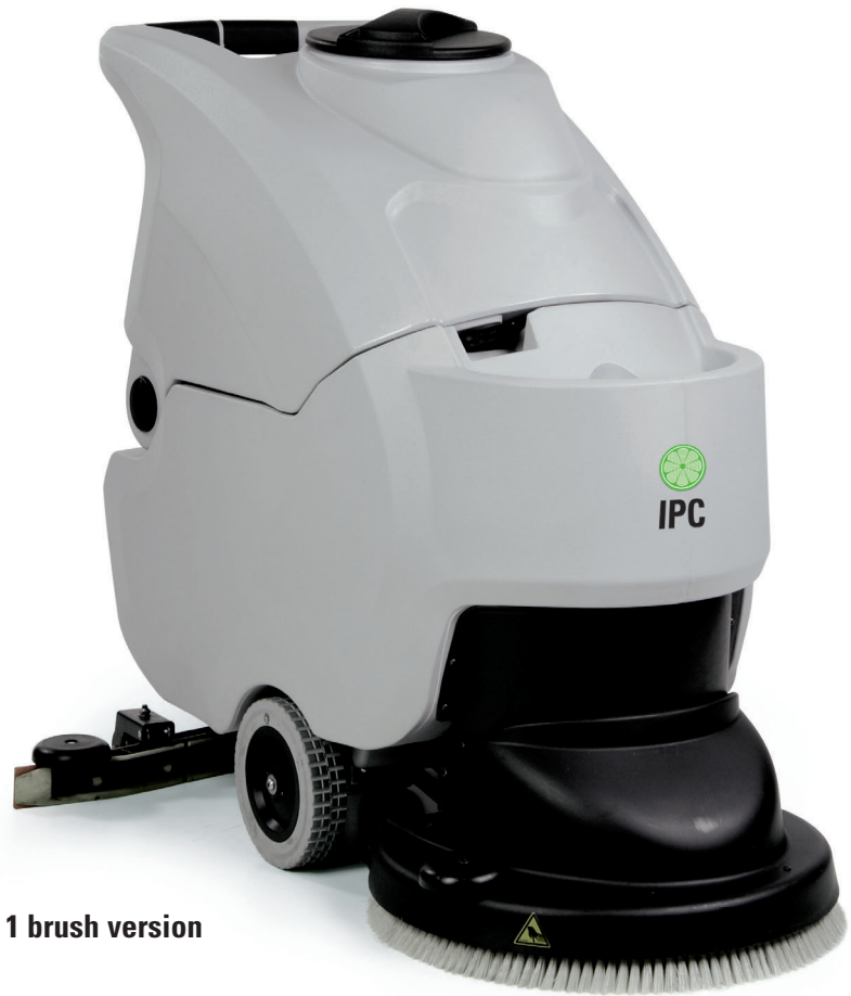
1 brush version

Panel control switches protected against water and humidity