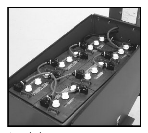
Sturdy battery tray protects components and floor below. It's impervious to battery acid and catches spills that might occur.