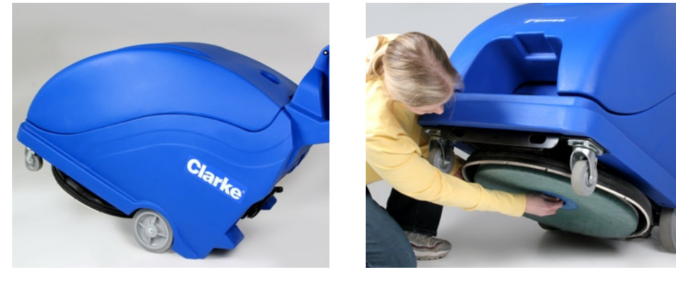
The operator can easily tilt back the machine for convenient pad change. The body features two molded foot areas for easy titling. There is also an angle-activated safety switch to prevent operation while in the tilted position.