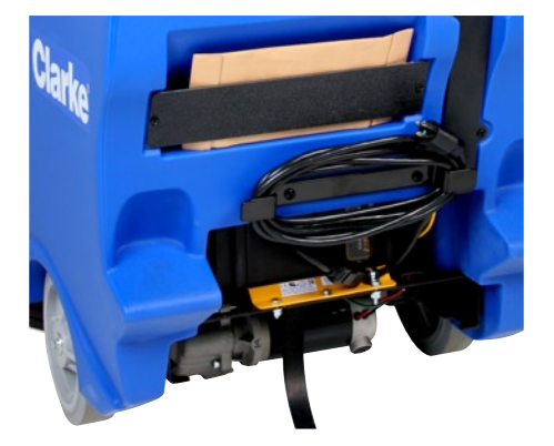
Onboard battery charging permits charging the batteries at any convenient location with a 120 V outlet. Also features storage for extra dust filtration bags.