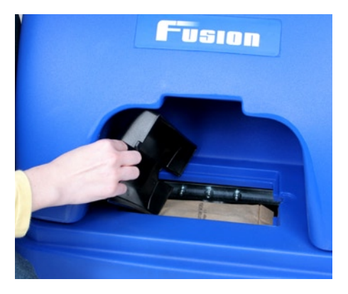
Passive dust control with easy access and changeout of dust filtration bag.