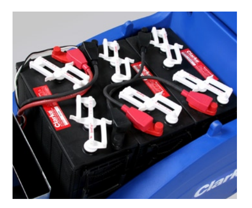
Battery compartment is easy to access. Battery options include either 195 Ah wet batteries or 234 Ah AGM batteries which feature long run times, longer life, and are totally maintenance free.