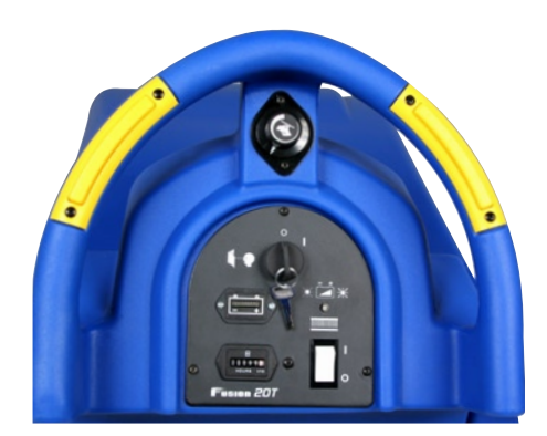
Comfortable and ergonomically designed control panel allows for simple, easy-to-use and read switches and gauges. Just turn it on and go. As shown, the Fusion 20T model.